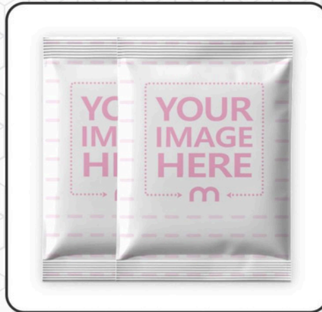
3 Side Seal Pouch

Premium multi-layer laminated packaging designed for high durability, barrier protection, and extended shelf life. Available in various formats, including: