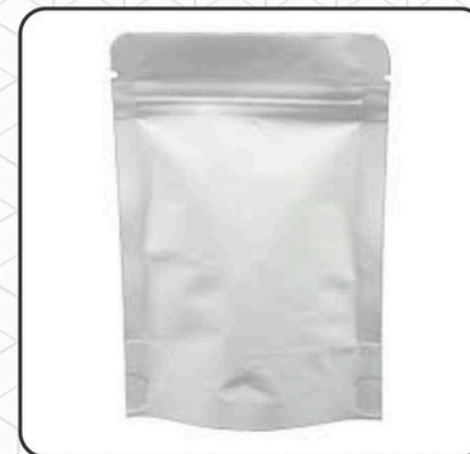
With Zipper Option

Perfect for food, pharmaceuticals, cosmetics, and FMCG products, with customizable printing and material combinations for branding and functionality.