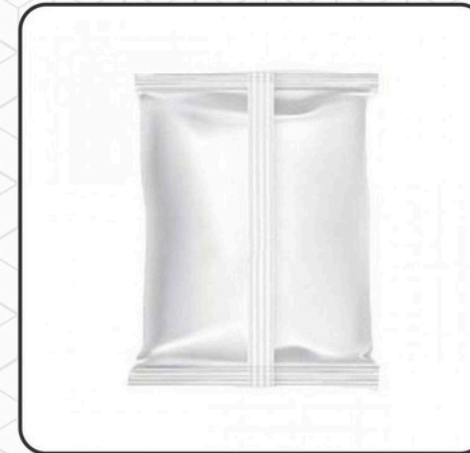
Centre Seal Pouch